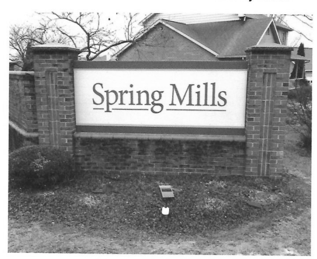
Falling Waters, West Virginia Inspected - January 24, 2019 Revised - January 13, 2020

Spring Mills Unit Owners' Association, Inc.